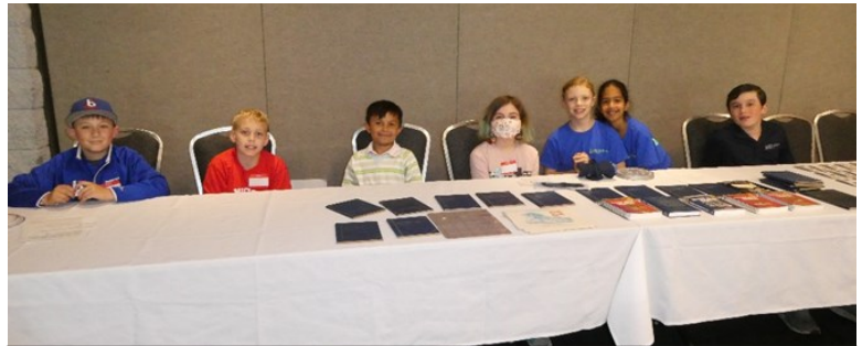
Students from St. Nicolas School at the YN Program

club. The students from St. Nicolas school performed a skit on the different coin designs that was fun and informative to watch.