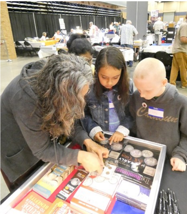
A Group of Home School Students with Their Teacher at the ANA Membership Table

At the show on Friday, April 14 th there were several groups of home schoolers in attendance. The students were brought to the Show to see rare coins and learn about the different collecting areas of numismatics and their related history.