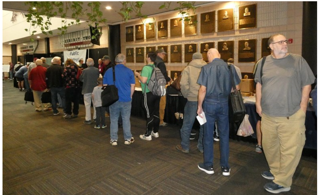
Dealers Waiting for Bourse Floor to Open at 8:30 am on Friday, April 14, 2023