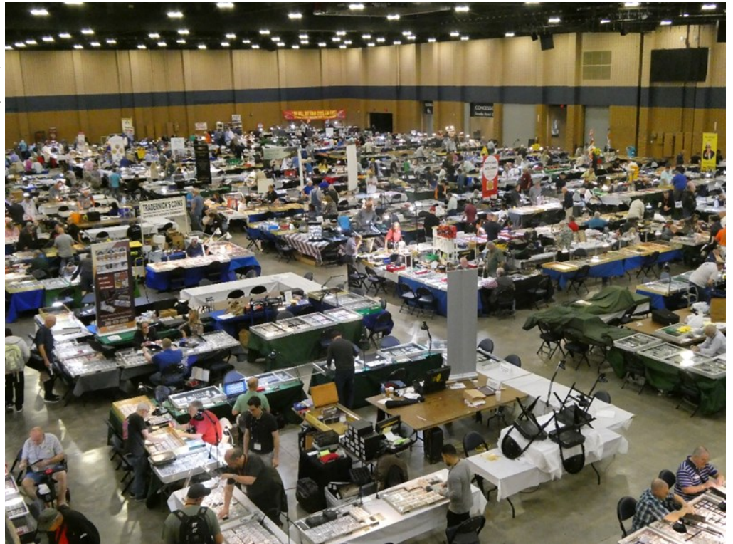
Overhead View of the Busy Bourse Floor on Friday Morning, April 14 th

At the show on Friday, April 14 th there were several groups of home schoolers in attendance. The students were brought to the Show to see rare coins and learn about the different collecting areas of numismatics and their related history.